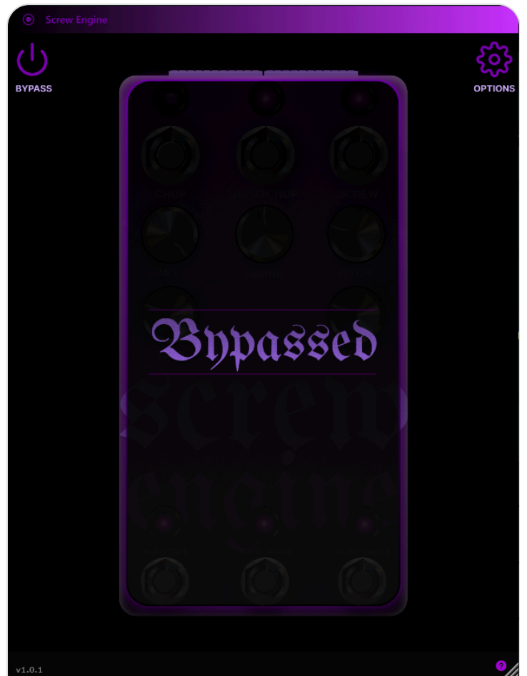
BYPASS MODE WITH VISUAL OVERLAY